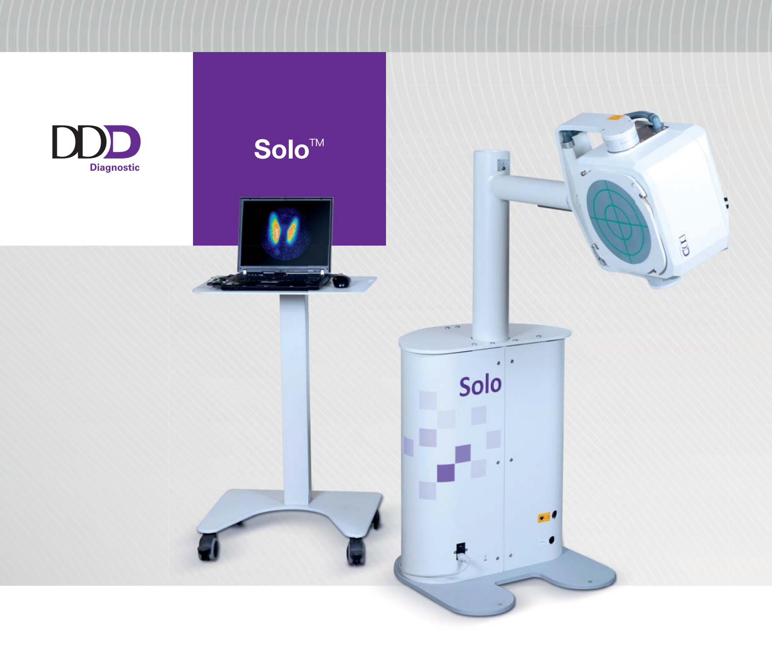
SFOV Gamma Camera Single-detector system dedicated for planar imaging